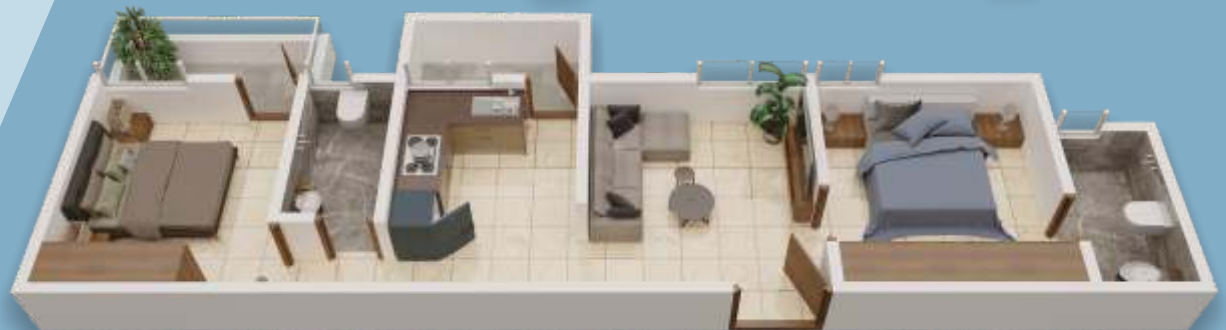
2BHK Comfort 720 SQ. FT. FLAT 102 TO 502