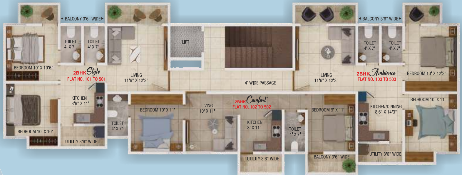
TYPICAL FLOOR PLAN FOR FIRST TO SIXTH FLOOR